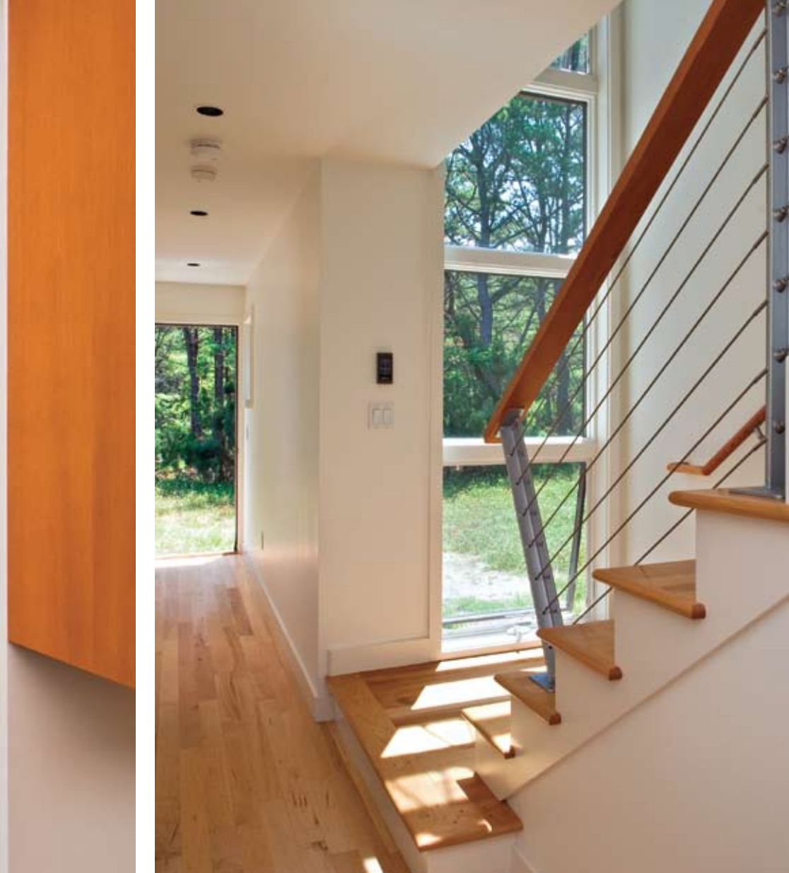
The interiors are open and bright. A wall of glass doors offers unobstructed views to the marsh. The staircase becomes a work of architectural art—it is seen from outside the home as well.

kitchen, dining area, living room, outdoor decks, and master bedroom—all sit on the upper floor, which is level with the grade. With a front-to-back alignment that sits north to south, the home is in place to receive ample light without being too bright and is also situated to receive the prevailing summertime southwesterly breezes.